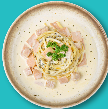
CARBONARA 15.0 (TURKEY BACON & CHICKEN HAM)

LINGUINE TOSSED IN TOMATO-BASED SAUCE, ENRICHED AND FINISH WITH PARMESAN CHEESE.