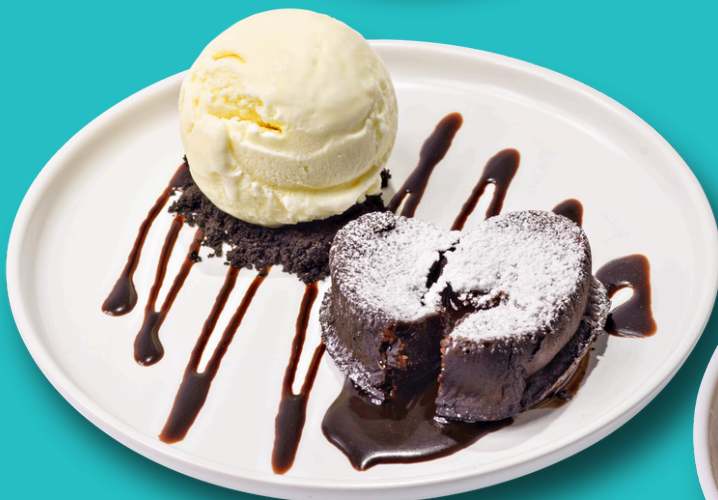
MOLTEN CHOCOLATE LAVA CAKE