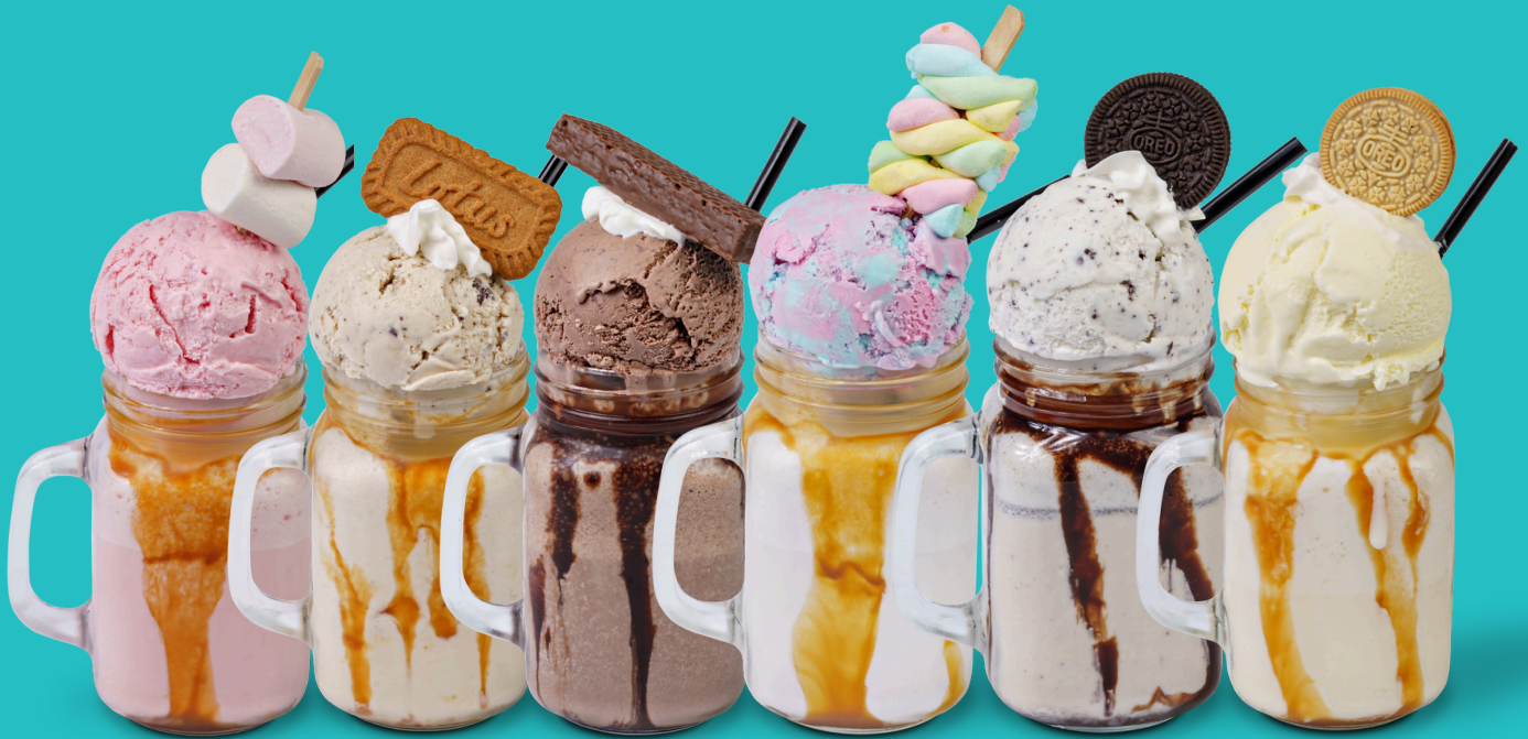
BERRY SWEET SALTED CARAMEL CHOCOLOVE RAINBOW PARADISE COOKIE TOP CREAM OF CROP