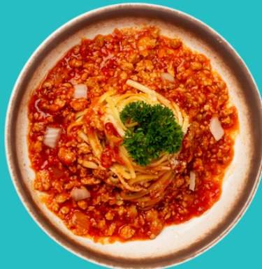
CHICKEN BOLOGNESE 15.0

LINGUINE TOSSED OIL, GARLIC, CHILLI AND SAUTEED MUSHROOMS.