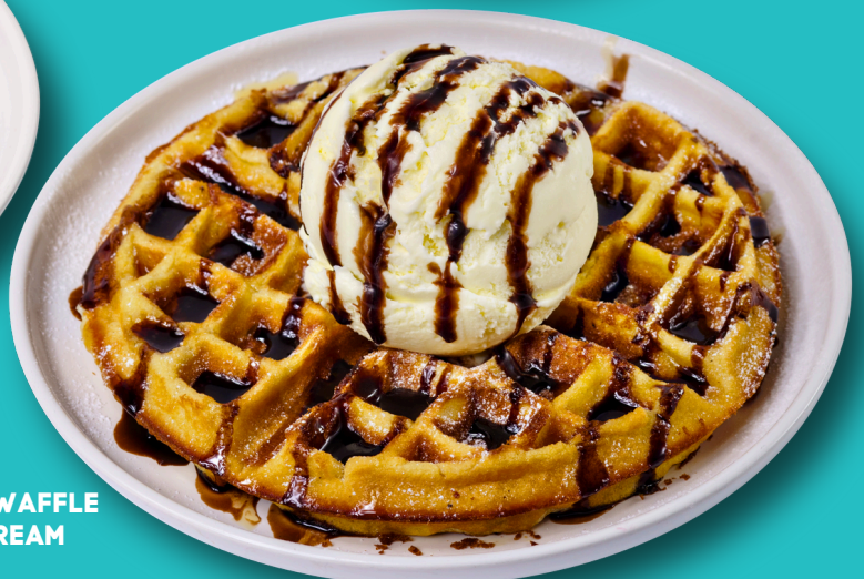
SIGNATURE WAFFLE WITH ICE-CREAM