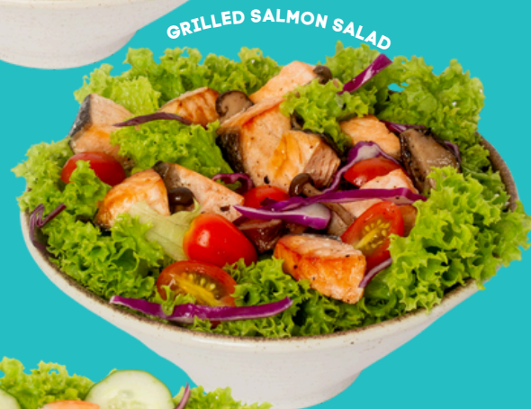
GRILLED SALMON SALAD