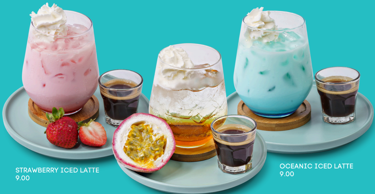
STRAWBERRY ICED LATTE 9.00